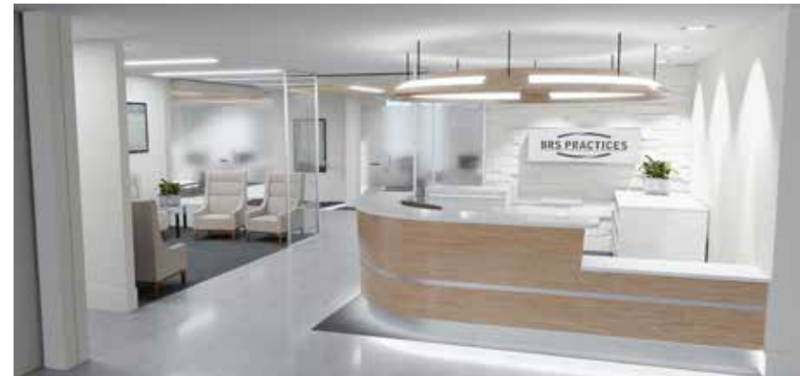
Images are artist conceptual renderings. Features, dimension, & specs are subject to change without notice.